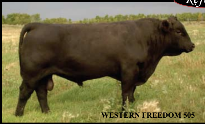
WESTERN FREEDOM 505