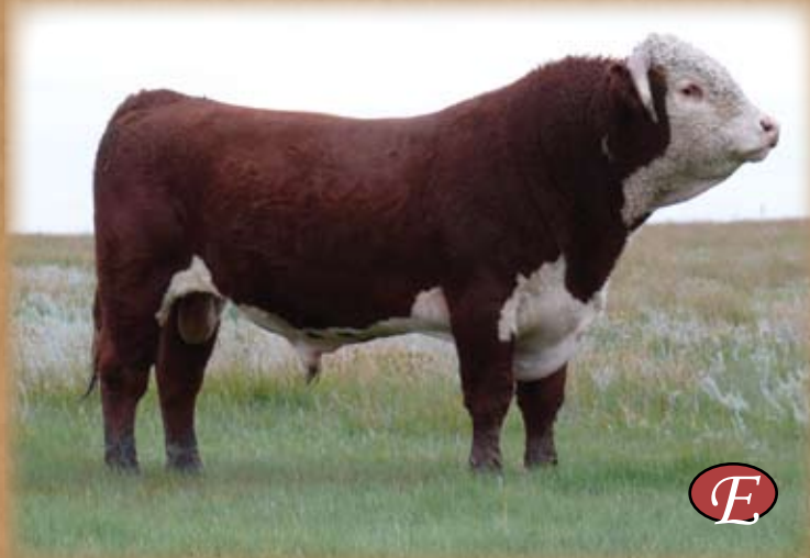
Fall 2010 EPD's ~ Top of the breed in blue

2007 Calgary Champion Bull! A bull with wonderful breed character. A great muscle pattern and all over structural correctness. A bull that breeds in performance and extra REA.