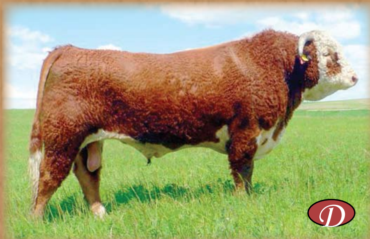
Fall 2010 EPD's ~ Top of the breed in blue