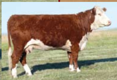
Fall 2010 EPD's ~ Top of the breed in blue