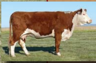
Fall 2010 EPD's ~ Top of the breed in blue