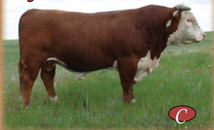
Fall 2010 EPD's ~ Top of the breed in blue