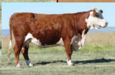
Fall 2010 EPD's ~ Top of the breed in blue